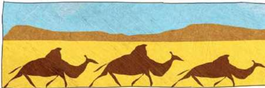
Across endless deserts...