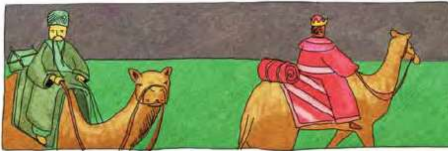
Over grassy plains...