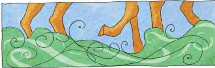
Through raging rivers...