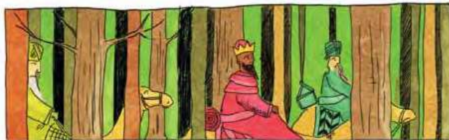
Down into deep, deep valleys...