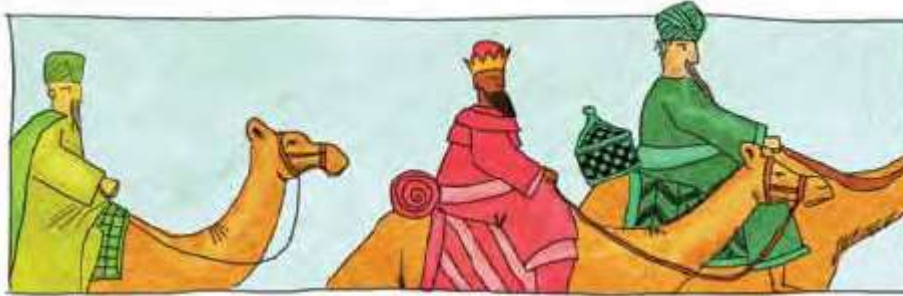
They rode their camels...